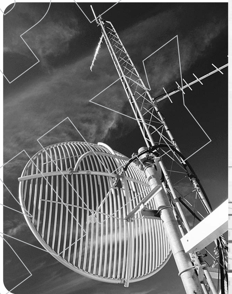
Communication is becoming more high-tech every day.

Taken together, they show how dramatically we are moving into the future, Fast Forward with Science.